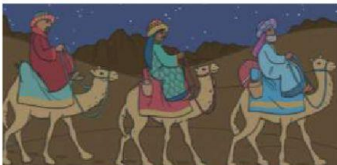
The wise men