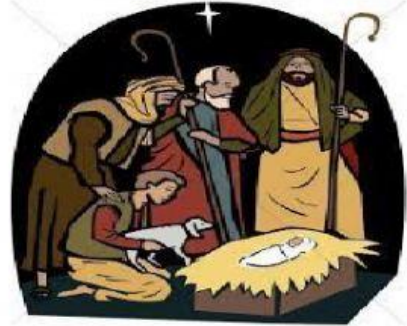
10. They found the baby in a manger.