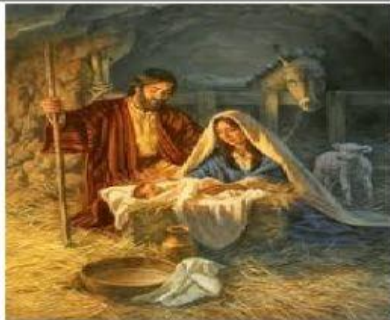
11. Mary and Joseph named the baby "Jesus".