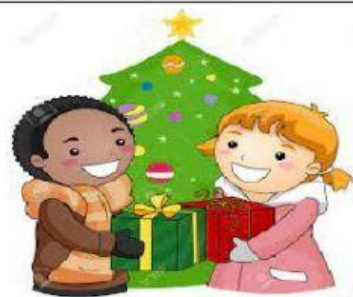
16. Today people give each other gifts on Christmas. They remember the gifts that the wise men gave to the baby Jesus.