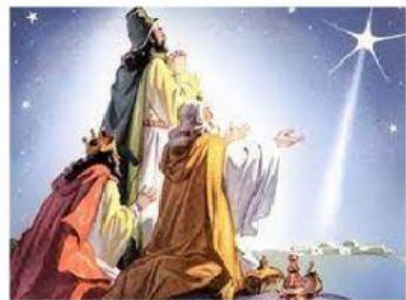
12. Later, wise men saw a special star in the east.