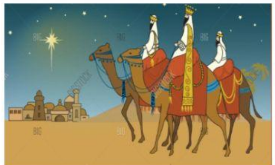
14. They followed the star to Bethlehem.