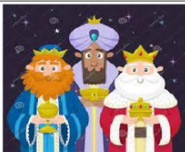
15. They brought gifts for the new-born king. They gave him gold, frankincense and myrrh. This was the first Christmas.