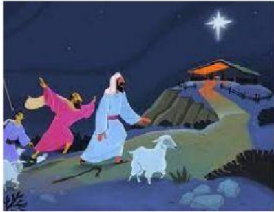
9. The shepherds went to Bethlehem.