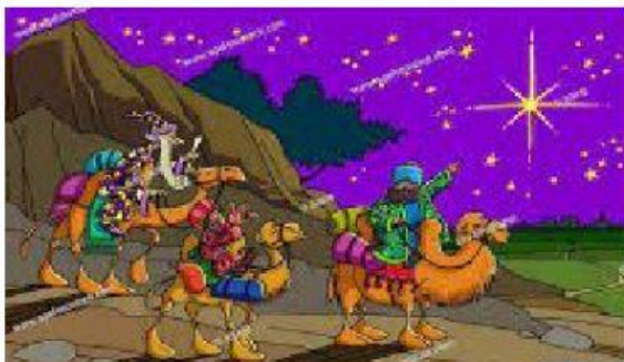
13. The special star led them to the baby king.