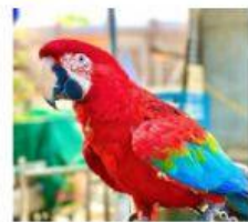
This is a cat