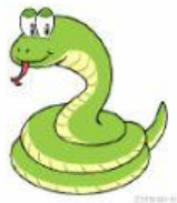
This is a mouse