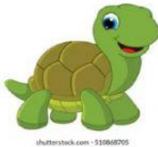
This is a tortoise