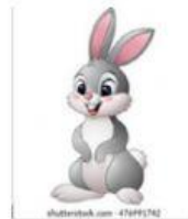
This is a rabbit