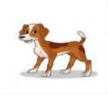
This is a dog