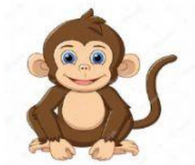
This is a bear