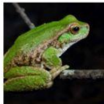
This is a frog