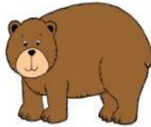
This is a snake