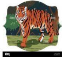
This is a tiger