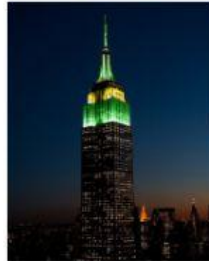
Empire State Building