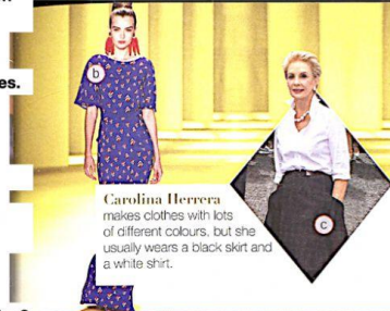
Carolina Herrera makes clothes with lots of different colours, but she usually wears a black skirt and a white shirt.