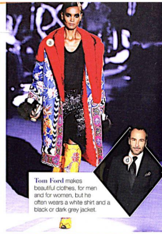
Tom Ford makes beautiful clothes, for men and for women, but he often wears a white shirt and a black or dark grey jacket.