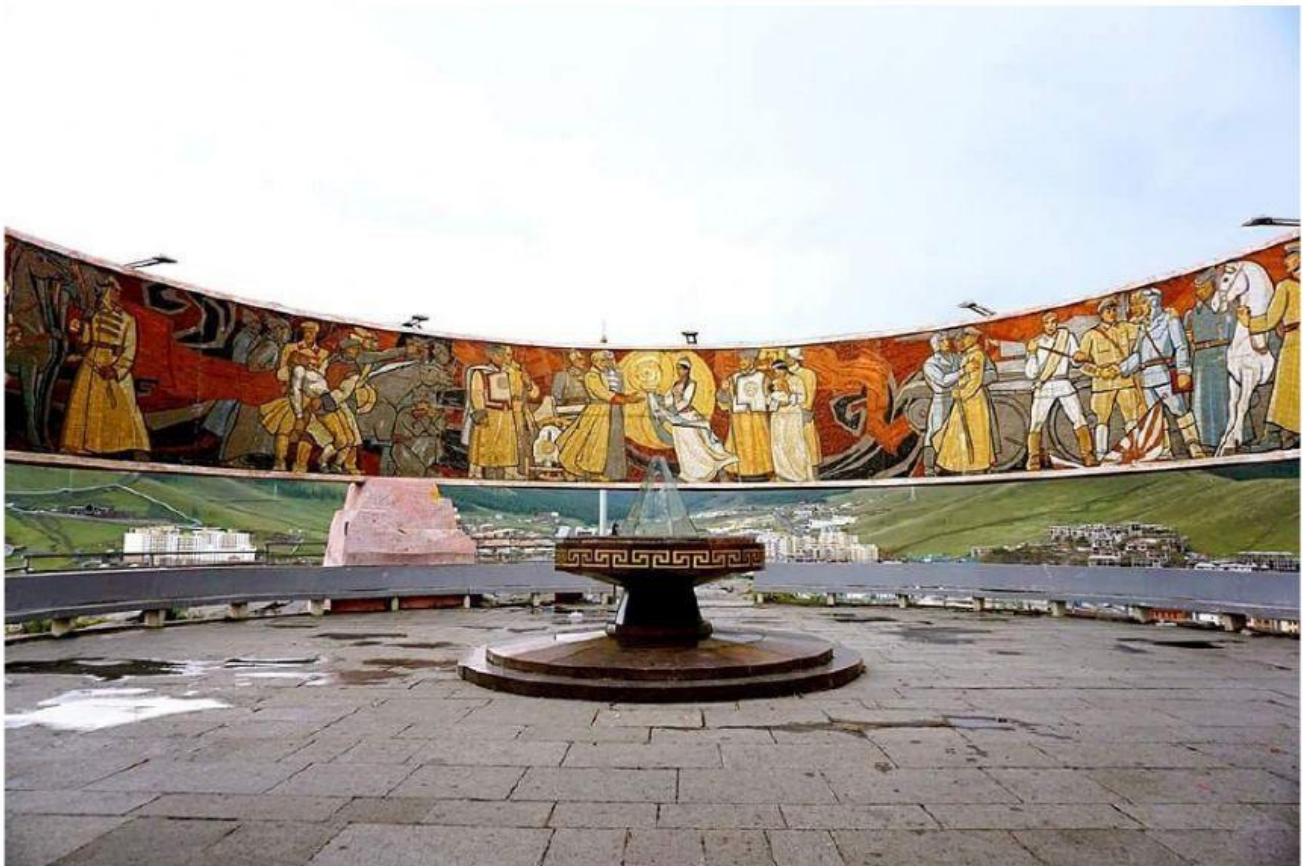
Saizan Memorial in the city of Ulán Bator