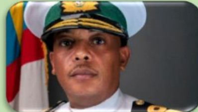
Commodore of the Defence Force