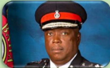
Commissioner of Police