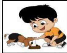
feed the dog