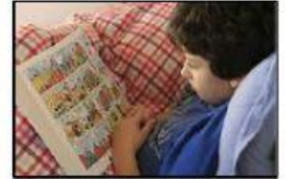
read comic books