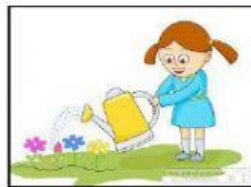
water the plants