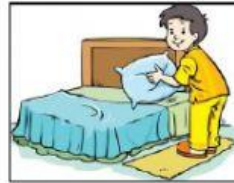
make the bed