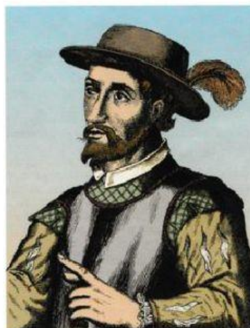
The Spanish explorer Ponce de León