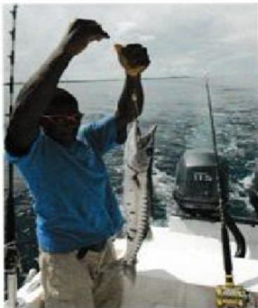
Deep sea fishing