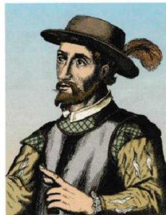
The Spanish explorer Ponce de León