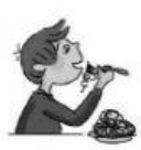
He is eating.