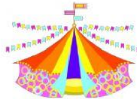
circ u s