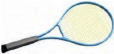
3 a racket