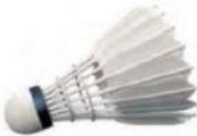
7 a shuttlecock