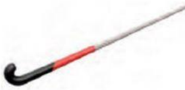
6 a stick