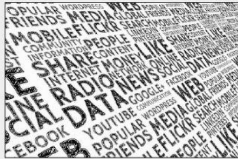
Gerd Altmann on Pixabay (2)