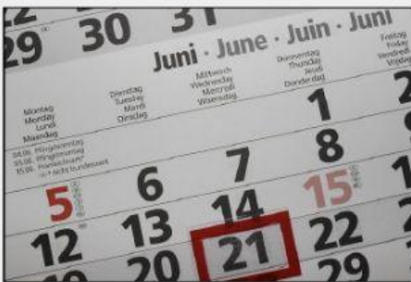
MaeM on Pixabay (3)