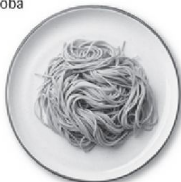
Japanese soba noodles

People also eat special food for birthdays. In the United States, people eat cake. But people in Korea eat seaweed soup. What special food do you eat?