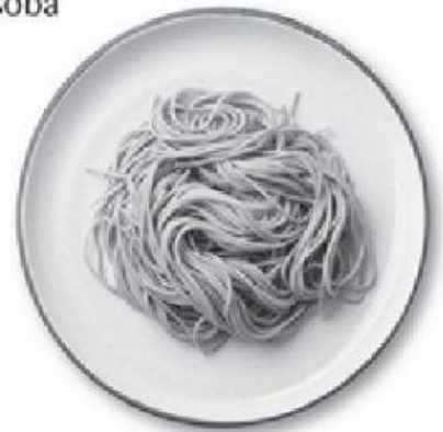
Japanese soba noodles

People also eat special food for birthdays. In the United States, people eat cake. But people in Korea eat seaweed soup. What special food do you eat?