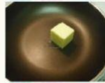
Butter heated in a pan