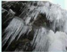
Falling water turned ice