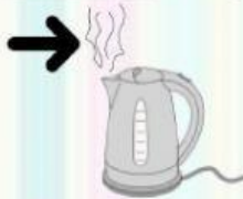
Steam from a teapot