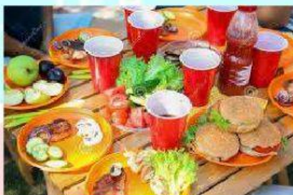
Food and drinks