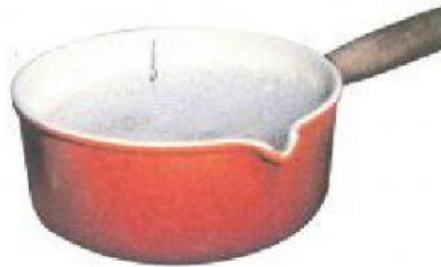
Boil water for 5 minutes.