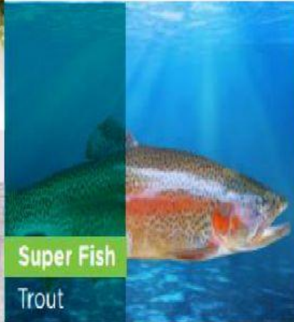
Super Fish Trout