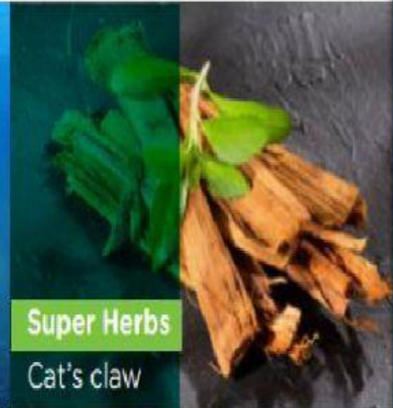
Super Herbs Cat's claw

Information extracted from PROMPERU. https://peru.info/en-us/superfoods