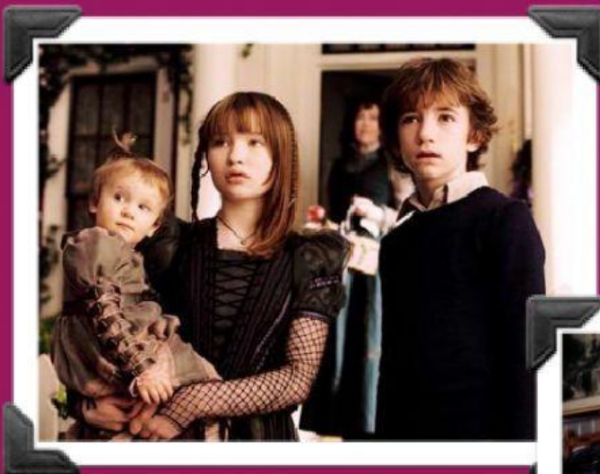
Sunny, Violet and Klaus Baudelaire