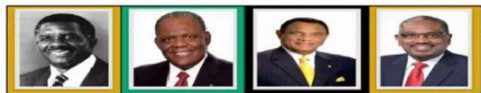
Former Prime Ministers: Sir Lynden O. Pindling, Hon. Hubert A. Ingraham, Hon. Perry G. Christie, Hon. Hubert A. Minnis