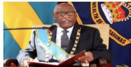
Governor General Sir Cornelius A. Smith