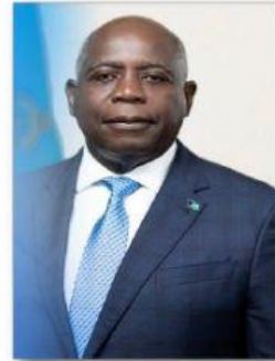
Prime Minister Philip "Brave" Davis

The Bahamas has had a Parliament since 1729. For centuries, The Bahamas was a British colony and although the House of Assembly could suggest how the country should be run, all laws had to be approved by Britain.