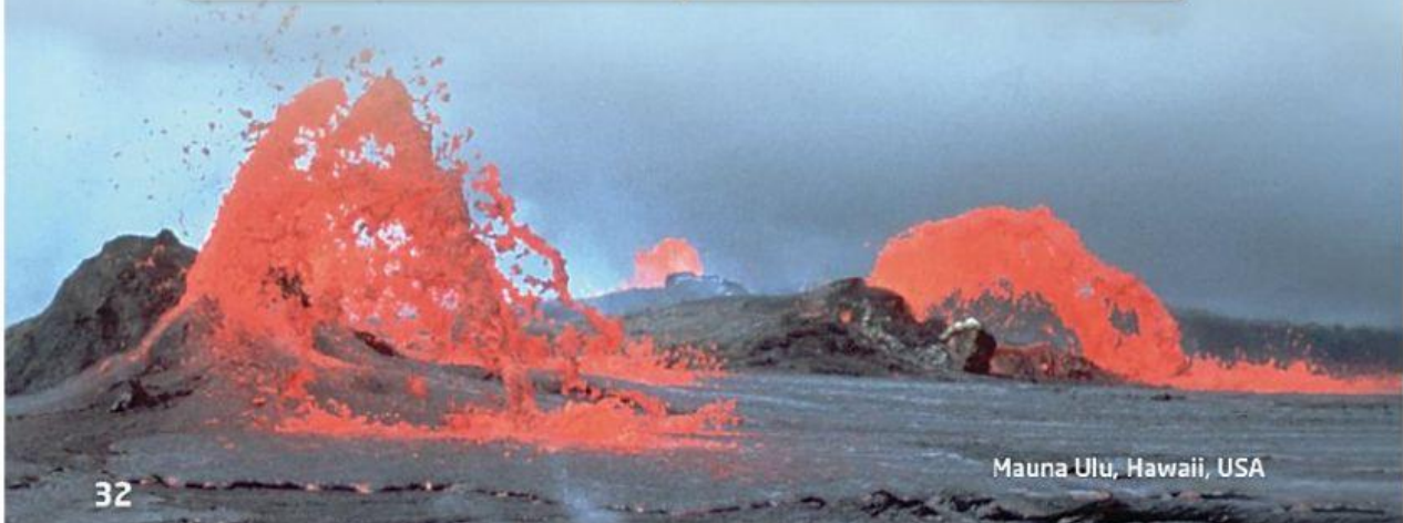
Mauna Ulu, Hawaii, USA