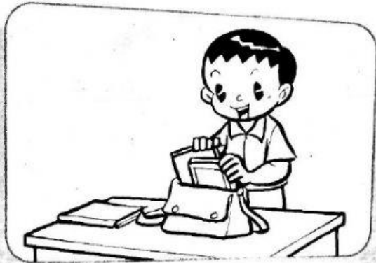
— packs — schoolbag