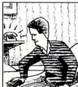
He stopped reading.