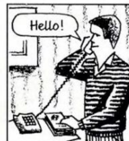
He answered the phone.

What happened ? The phone rang . ( past simple )