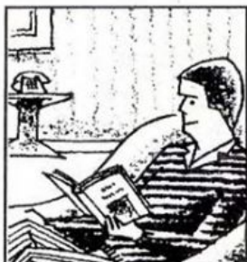
Jack was reading a book.