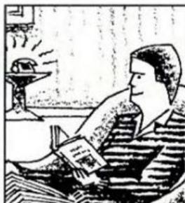
The phone rang.