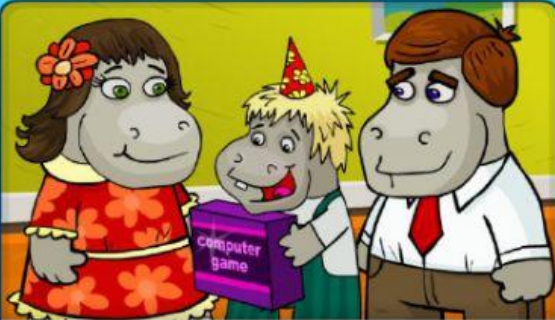
Wow! I have a new computer game! Thank you, auntie! Thank you, uncle!