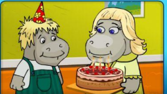
My mommy has a big birthday cake for me! Thank you, mommy!