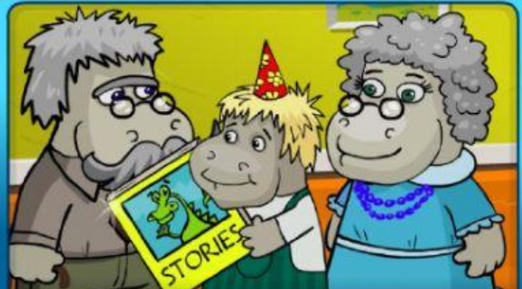
Wow! I have a new storybook! Thank you, grandma! Thank you, grandpa!