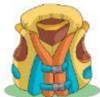
a life jacket