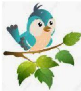
e) A BIRD