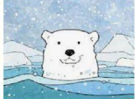
c) A POLAR BEAR