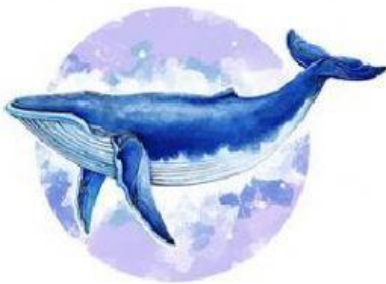
d) A WHALE