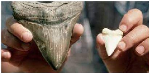
A megalodon's tooth and a modern white shark's tooth.