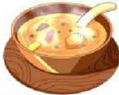
4. juice _____