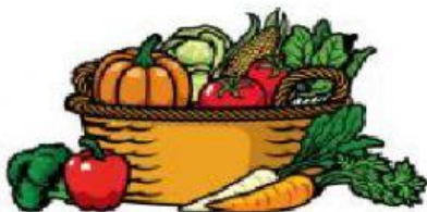
1. eggs vegetables

Look at the pictures. Correct the words.