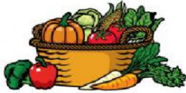
1. eggs vegetables

Look at the pictures. Correct the words.