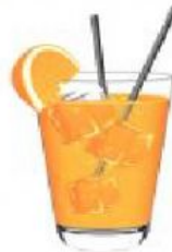
8. chicken _____