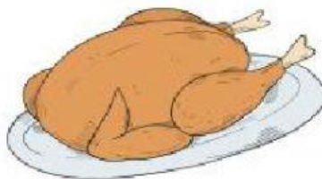
2. fish _____