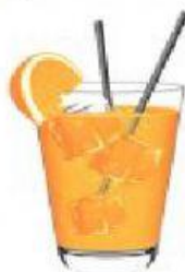
8. chicken _____