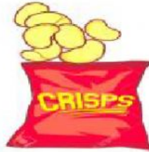
5. burger _____