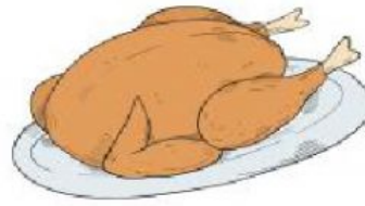
2. fish _____