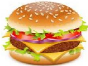
7. cheese _____