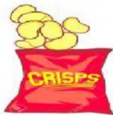
5. burger _____