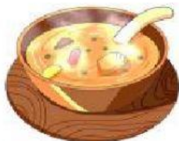
4. juice _____