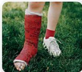
a broken leg