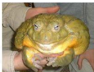
4. The goliath frog can be over 1 foot long and weigh over 7 pounds.

3. When frogs are first born, they look very different. First of all, frogs do not have live births. The mothers actually lay eggs. Once the eggs are ready, they hatch into tadpoles, or baby frogs. Tadpoles have long tails and can only live in the water. As the tadpoles grow, their tails get shorter and they begin growing legs. Eventually, in about 3 months, the tadpoles completely lose their tails and are ready to be able to live on land too.