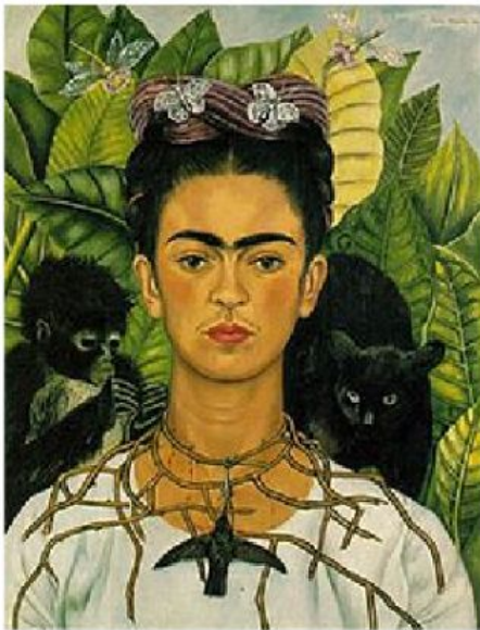
Self-Portrait with Thorn Necklace and Hummingbird, by Frida Kahlo

She 20 _____ (marry) another artist, Diego Rivera, and two years later they 21 _____ (move) to San Francisco. They also 22 _____ (live) in Detroit, but she 23 _____ (feel) homesick, so they 24 _____ (return) to Mexico.