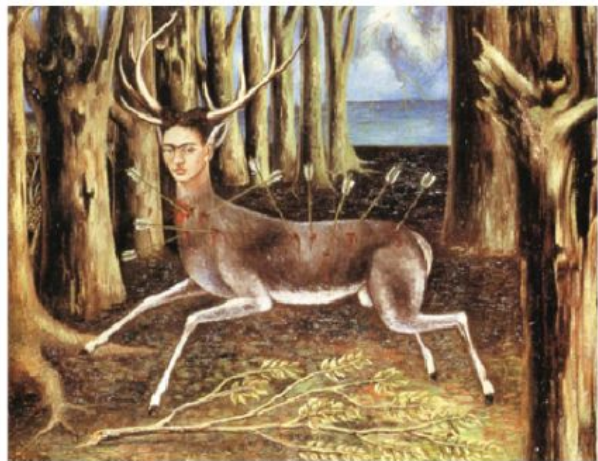
The Wounded Deer, by Frida Kahlo