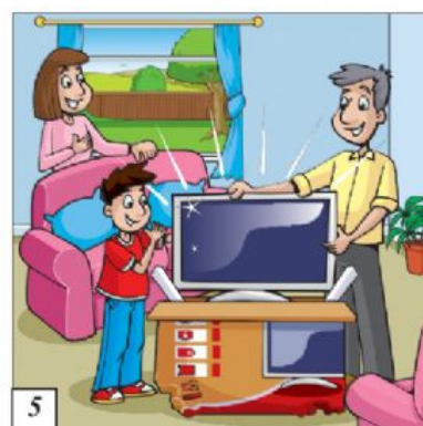
FLYERS SPEAKING. Picture Story