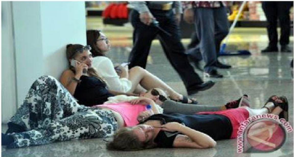
Some international tourist laid down the floor waiting for the operations of Ngurah Rai International Airport, Bali, today. The airport is closed until the next 24 hours due to the volcanic ashes in Mount Barujari, West Nusa Tenggara Province.