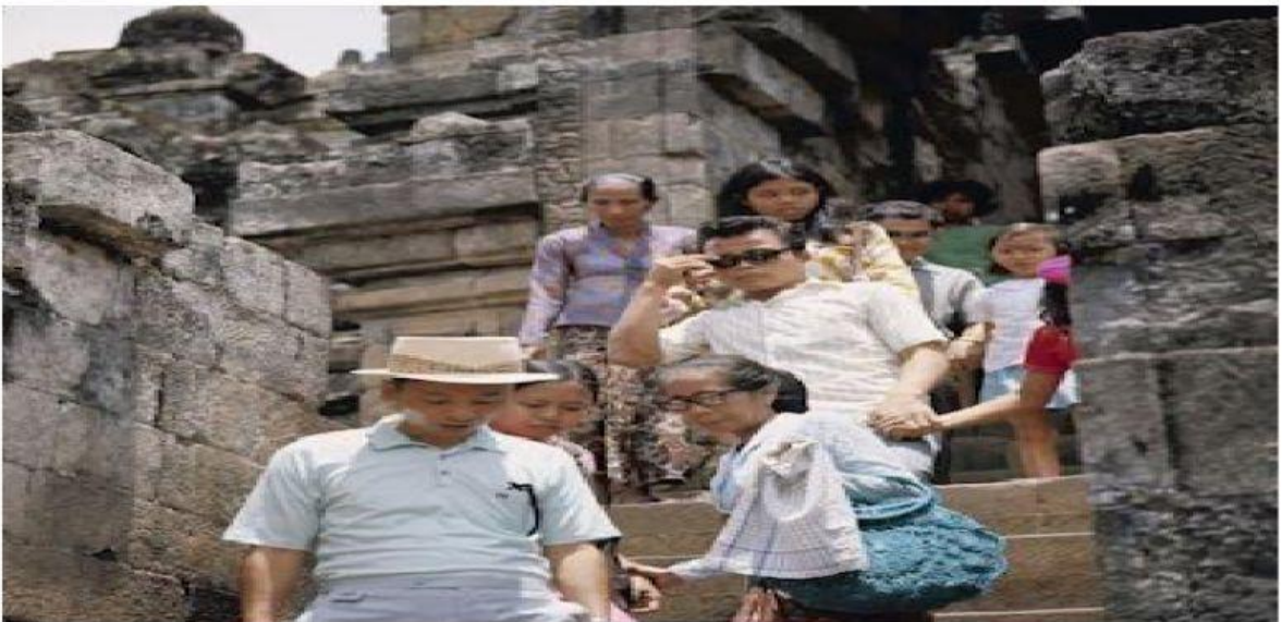
Tourists in Borobudur