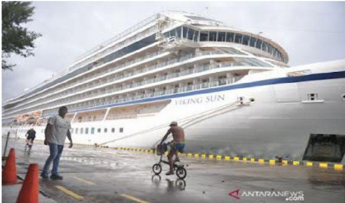
Foreign tourists pass by the Viking Sun cruise ship being anchored at Bali Island's Benoa Seaport.