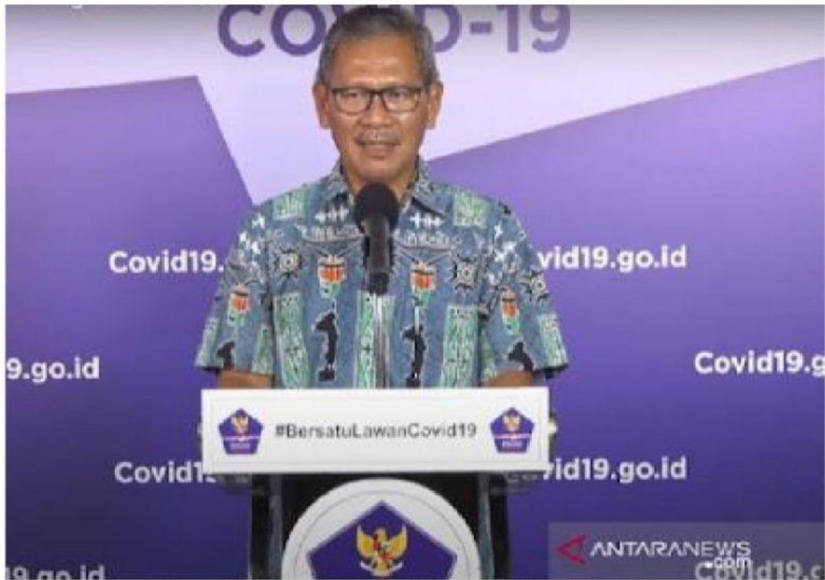
The government spokesman for COVID-19 handling Achmad Yurianto.