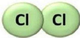
Molecule of chlorine