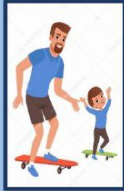
Footbaal Nurse Skateboard