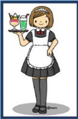
Waiter Ballet Waitress