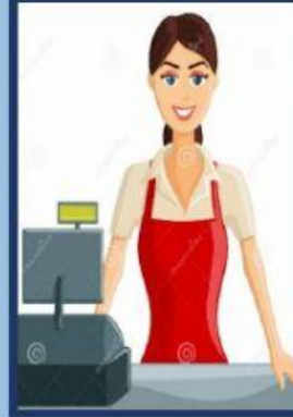
Shop assistant Drawing Secretary