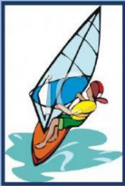
Windsurfing Doctor Judo