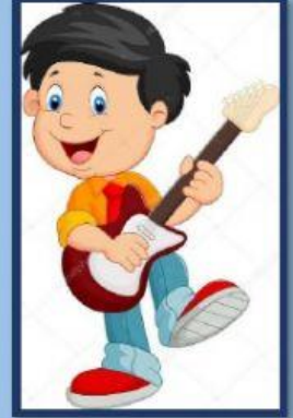
Play the piano Play computer Play the guitar