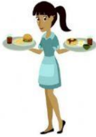
This is the waitress