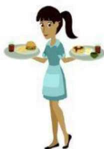
This is the waitress