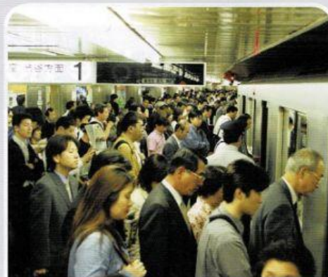
Millions of commuters travel by train each day in Japan.