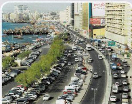
Rush-hour traffic in Dubai. Dubai has the busiest streets in the Middle East.