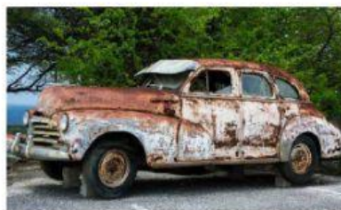
Rust forms on a car