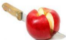
An apple is cut