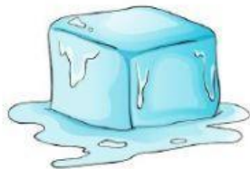
An ice cube melts