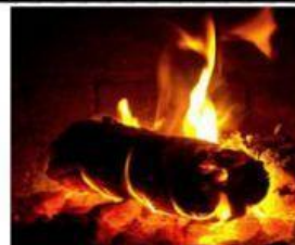
A log burns at a campfire