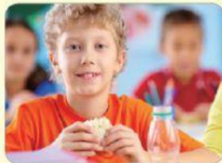
I am eating lunch now.