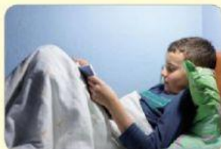
He isn't sleeping .