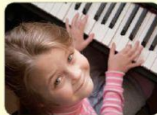
She is playing the piano.