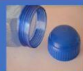
A BOTTLE CAP