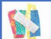
A PIECE OF FABRIC