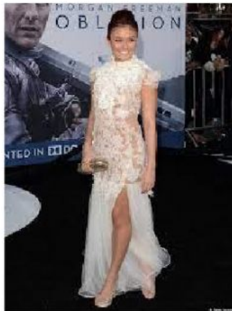
Indonesian actress Agnes Monica attend The 2020 Grammy award