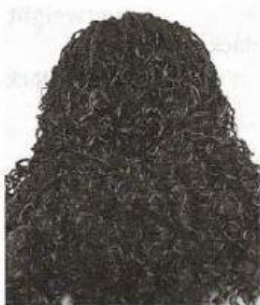
long black hair