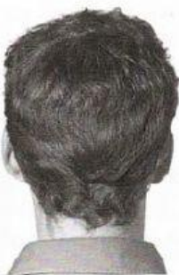
short brown hair