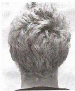
wavy blond hair