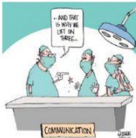
not clearly expressed