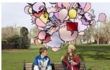
talking in a confused way