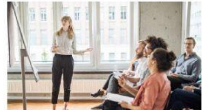
able to express ideas well