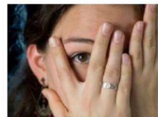
reluctant to speak