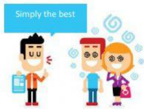
good at influencing people