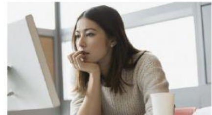
paying attention to a particular aim