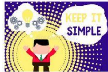
clear and easy to understand