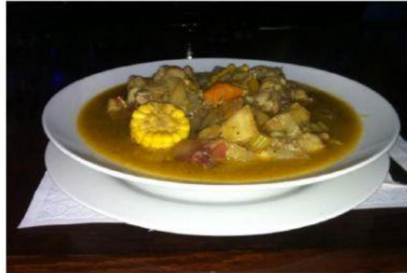
Superkanj or Okra Soup

Another tradition was the Asue which is a way of saving money.