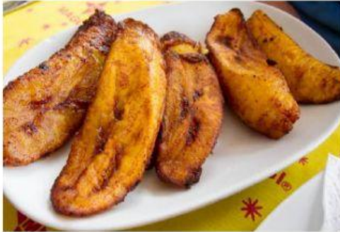
Dodo or fried plantains

One thing was their way of preparing food. From Nigeria, they brought dodo which is fried plantains. From Gambia they brought superkanj which is okra soup.