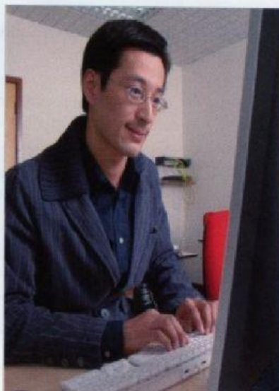
5 Tim is a _____