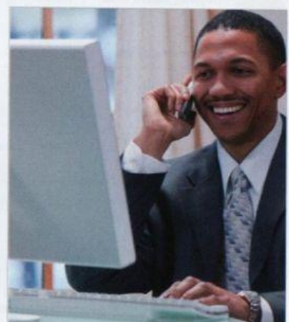
3 Freddy is a _____