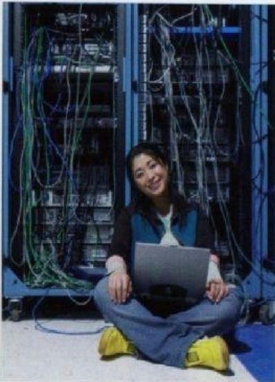
4 Hana is a _____