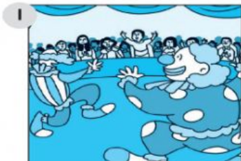
spectators – benches – patiently – show