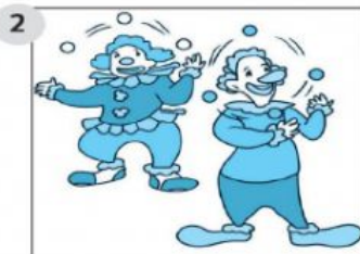
clowns – jugglers – balls