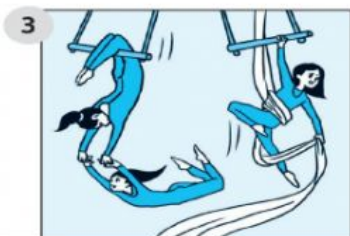
trapeze – stunts – ropes – swinging