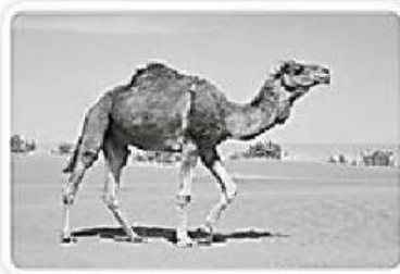
1 crocodile / camel