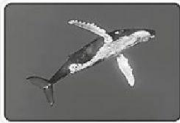
4 cheetah / whale