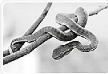
2 snake / seal