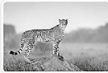
5 cheetah / seal