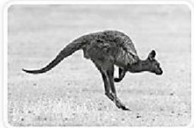
3 panda / kangaroo