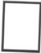
on the wall