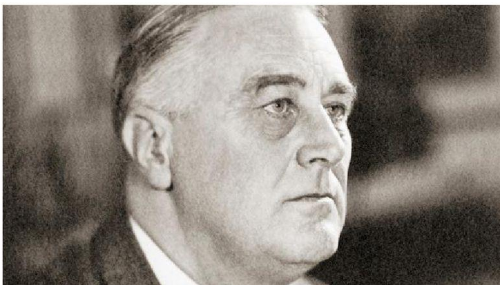
Franklin Delano Roosevelt was president of the United States at the time of the attack on Pearl Harbor.

It was, as then President Franklin Delano Roosevelt would call it, "a date which will live in infamy."