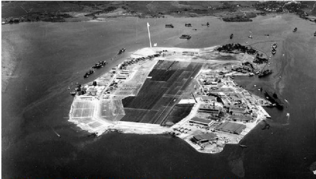
An aerial view of part of Pearl Harbor before the attack on December 7, 1941

But because the U.S. base in Hawaii was relatively close to these countries, the Japanese worried that the United States would _____ soldiers from Pearl Harbor to defend the nations if they were attacked. By destroying the U.S. military presence in the region, the countries Japan wanted to target would _____ left vulnerable. So Yamamoto decided to move forward with a surprise attack on the U.S. fleet in Hawaii.