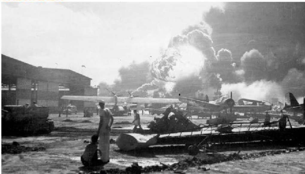
Sailors stand amid wrecked planes, watching as the U.S.S. Shaw explodes in the center background.