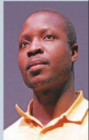
William Kamkwamba at a speaking event in 2013